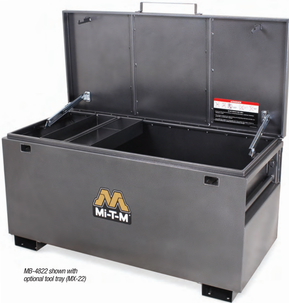
MB-4822 shown with optional tool tray (MX-22)

The Mi-T-M jobsite tool boxes are rugged enough for any construction site. The heavy-duty solid-steel construction offers added protection for your valuable tools and the special locking lid support locks the lid open for easy access. The special powder-coated finish offers extreme durability in the harshest of environments.