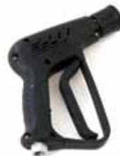
Iride Kew Style