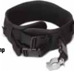
Belt and pole clamp