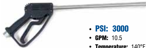
AP Single Barrel Dump Gun

Water continues to run through the tube even when trigger gun is closed.