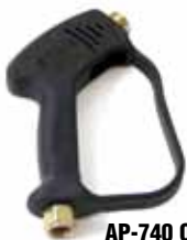
AP-740 Open Gun