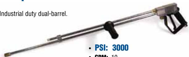
Dual Barrel Dump Gun