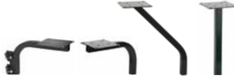
Universal 90-degree 45-degree Vertical