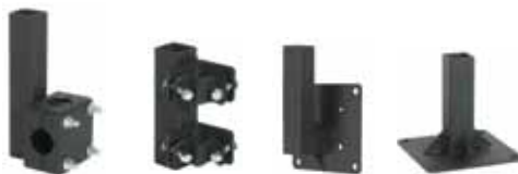
Universal Mount Skid Mount Wall Mount Base Mount