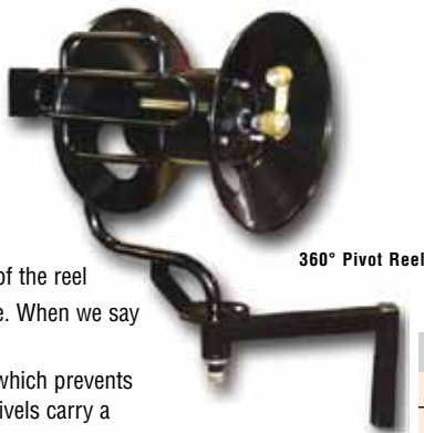
360° Pivot Reel