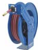
8.723-649.0 (hose and ball stop not included)