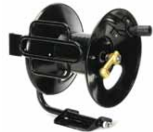
Fixed Base Hose Reel