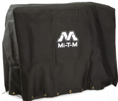
HS Series shown with optional hot water skid equipment cover (AW-6000-1006)